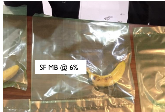
Bananas Day 14

Very slight deterioration compared to the deterioration without packaging. The bananas after 14 days look as deteriorated as 3 days old bananas in open. The shelf life seems to have extended by 5 Times or 500%