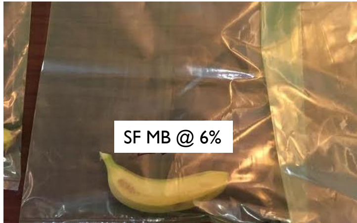
Bananas Day 1