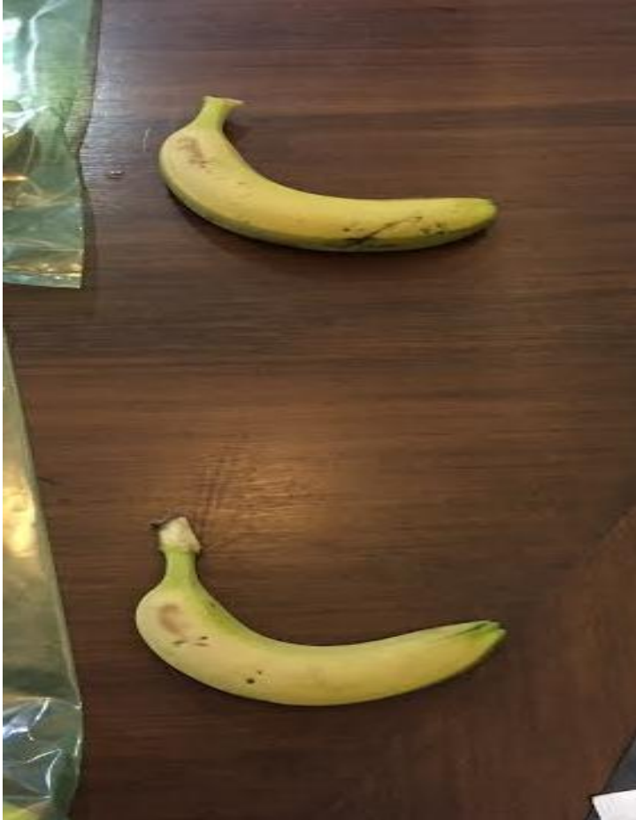
Bananas Day 1