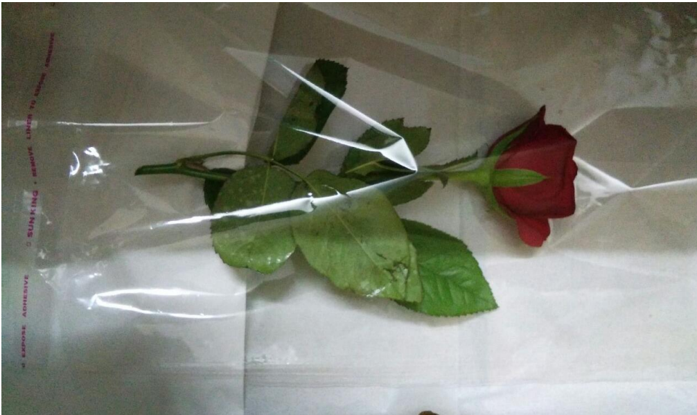
Flower in Normal Bag