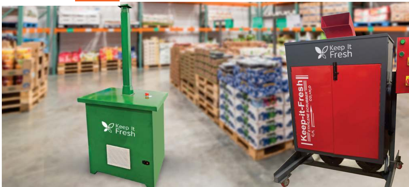
KIF SCRUBBER PLUS 50,000 CFT AREA