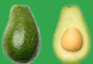
Fruits inside MAP Bags