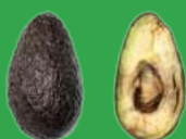
Fruits outside MAP Bags